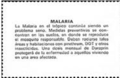
text on reverse

Designer: Alexander Larkin, Basingstoke, Hampshire, England Design Size: 44½ x 28 mm Producer: Format International Security Printers, Ltd. Process: Lithography Format: sheets of 50: 2 panes of 25 (5 x 5); pane A over pane B; vertical gutter pairs may exist Selvage: plate number (1A or 1B) in each of four ink colors below position 21; Format International Security Printers Ltd. in black below position 24-25; "traffic lights" in each of four ink colors right of positions 5 and 10; perforations through bottom and right of pane 1A and through top, bottom, and right of pane 1B; 3-5 perforations at left; Format International Security Printers, Ltd. in light blue repeated in 2 lines between panes, all or part of which may show on a pane Quantity: Paper: white Watermark: none Perforations: 13½ x 44 Margins: clear Purpose: raise money for building hospitals Sub-topics: mosquito; sprayer Notes: descriptive text printed in black on reverse; from a 12-stamp issue Price: A